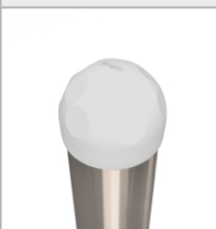
PLATE AND ROPE CONNECTORS MADE OF INJECTION MOLDED POLYAMIDE

SAFE PIPE PLUGS MADE OF INJECTION MOLDED POLYAMIDE